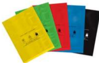
Waste Collection Bag