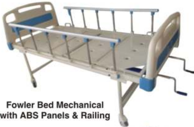
Fowler Bed Mechanical with ABS Panels & Railing