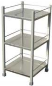
MS Bed Side Locker