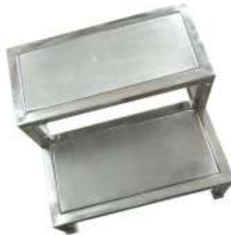
Foot Step Double (Stainless Steel)