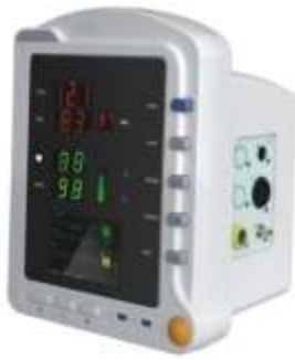
TABLE TOP PULSE OXIMETER WITH NIBP