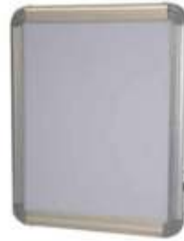
Led X Ray View Box (Single)