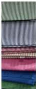
Lining Bed Sheets