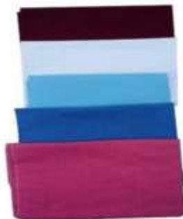
Plain Bed Sheets