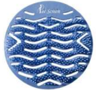
Fragranced Urinal Screen