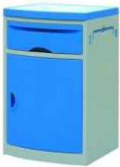
ABS Bed Side Locker