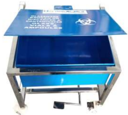
Stainless Steel Trolley for Glass Waste