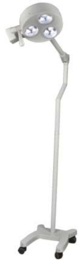
LED EXAMINATION LIGHT GOLD STAR