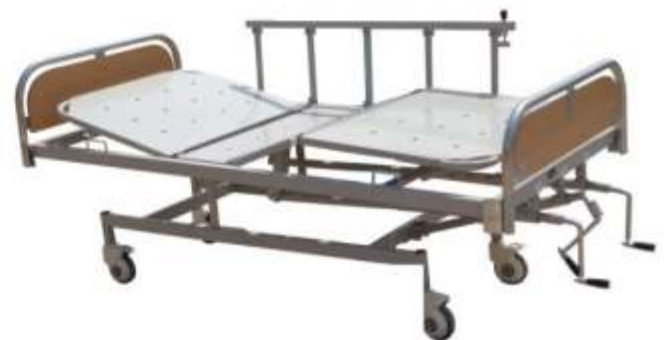
ICU Bed Non Hi-Low Mechanical with Wooden Panels & Railing