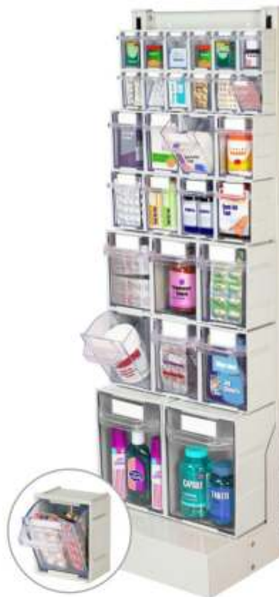
SINGLE SIDE UNIT TILT BINS COMBINATIONS