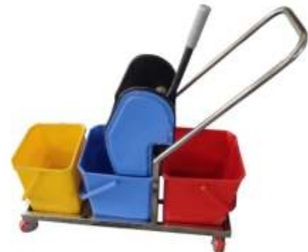
Mop Wringer Trolley Triple Bucket with Stainless Steel Frame