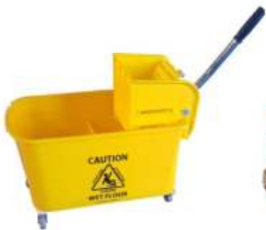
Mop Wringer Trolley Single Bucket