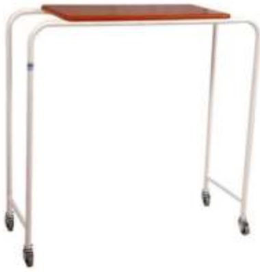
Over Bed Table