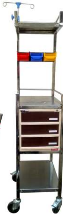
Single Rack Crash Cart