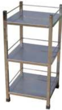
SS Bed Side Locker