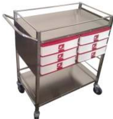
Medicine Trolley with Plastic Rack