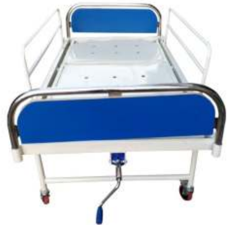
Semi Fowler Bed Mechanical with Wooden Panels