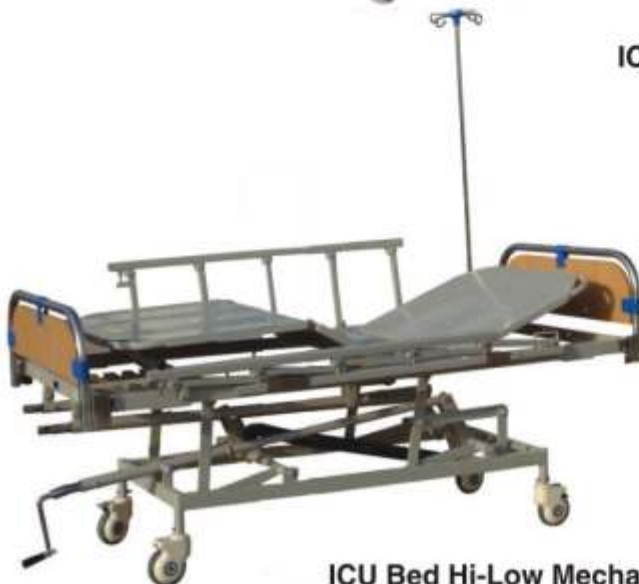
ICU Bed Hi-Low Mechanical with Wooden Panels & Railing