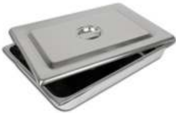
SS Instrument Tray