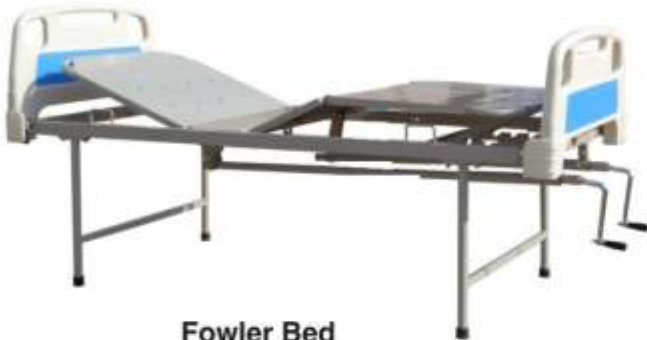
Fowler Bed Mechanical with ABS Panels