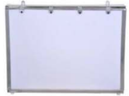
Led X Ray View Box (Double)