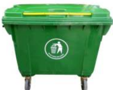
660 Ltr. Four Wheel Trolley