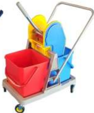
Mop Wringer Trolley Double Bucket