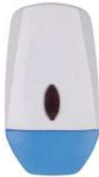
Soap Dispenser Plastic