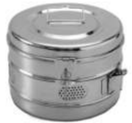
SS Dressing Drum