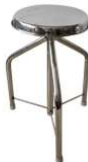
SS Revolving Stool