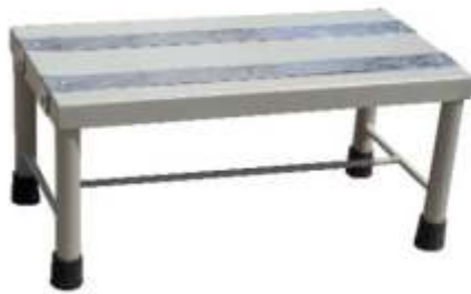
Foot Step Single