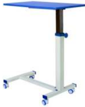
Patient Food Trolley