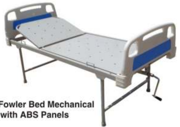
Semi Fowler Bed Mechanical with ABS Panels