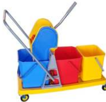
Mop Wringer Trolley Triple Bucket