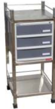
Medicine Trolley with ABS Rack