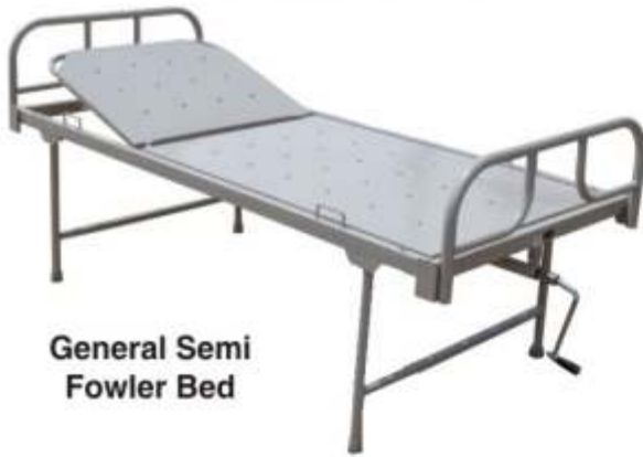
General Semi Fowler Bed