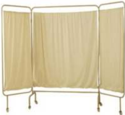
Bed Side Screen