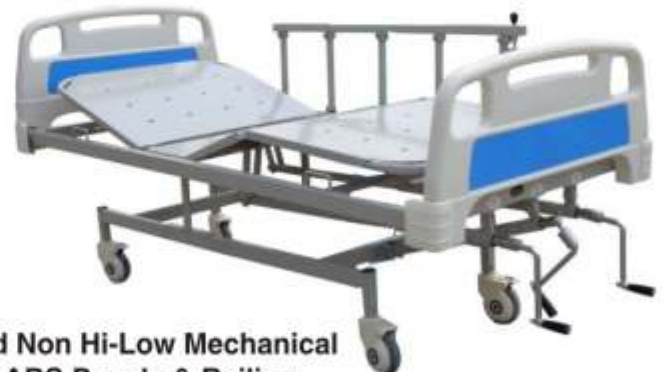
ICU Bed Non Hi-Low Mechanical with ABS Panels & Railing